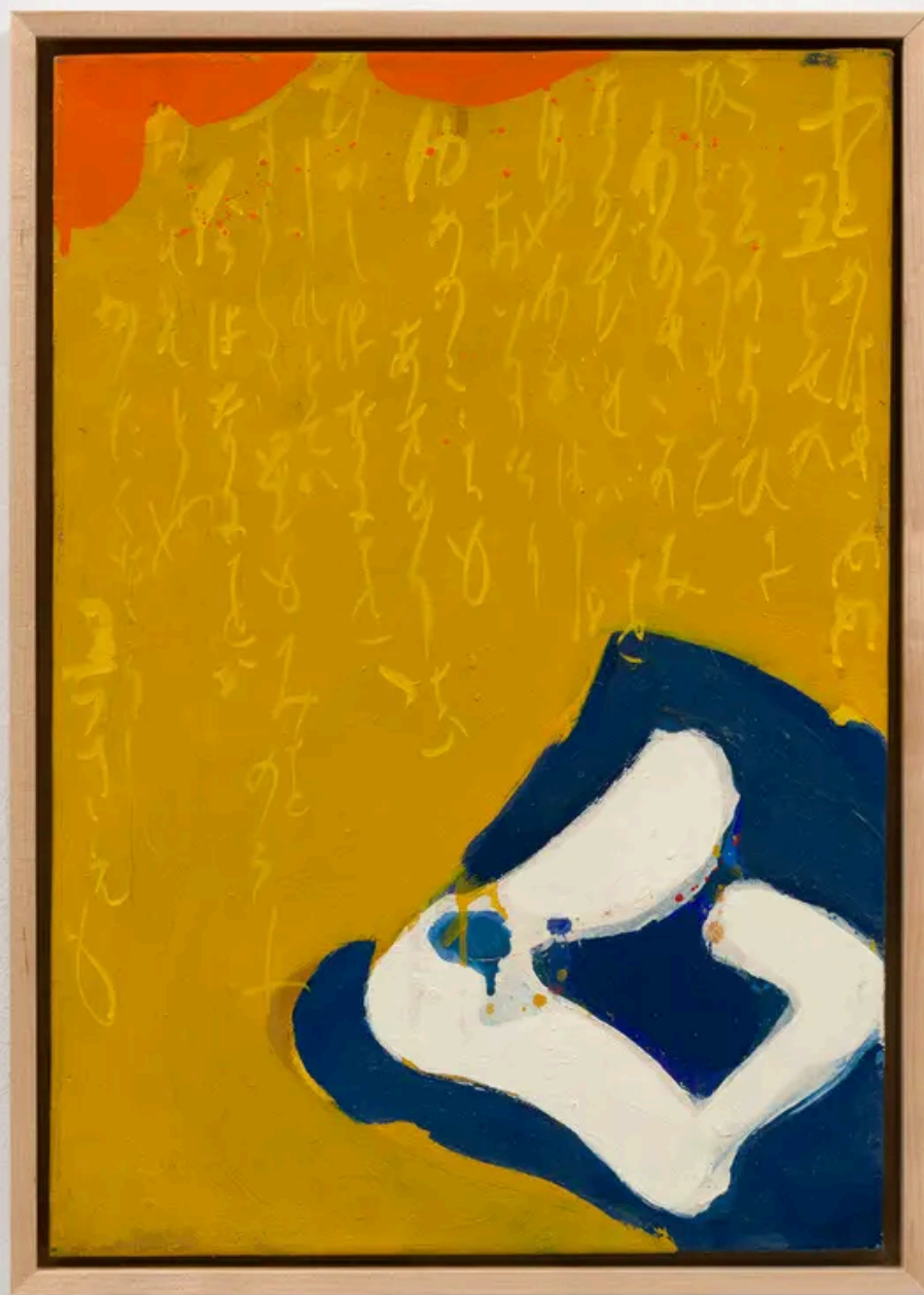
Teruko Yokoi, Untitled , 1969. Oil on canvas, 19 3 / 4 × 13 3 / 4 inches.